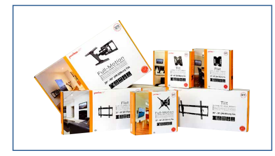
Comes in color packaging with included installation hardware and easy to follow instructions.