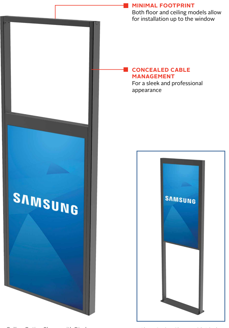
Ceiling Option Shown with Display (DS-OM46ND-CEIL/DS-OM55ND-CEIL)